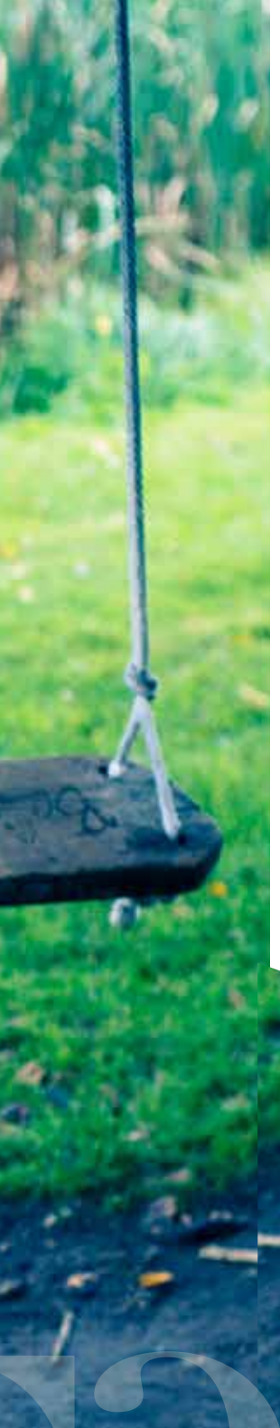
Read the Personal Stories of UConn's Incoming Class

Behind every aspiring UConn Husky is a story waiting to be told. This fall, UConn's Class of 2017 arrived with the most impressive academic record of any incoming freshman class in the history of the University — and yet even grade point averages, SAT scores, and extracurricular activities can't say it all. Here, in this collection of college admissions essay excerpts, we invite you to get a glimpse of the luminous personalities, personal experiences, and hard-won insights that define some of UConn's newest students, as they tell you who they are, in their own words — with style, emotion, and candor.